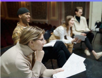
Outrageously funny moments often happen in play readings.

PLAY READING PLUS SOUP & CRUSTY BREAD APPLE PIE & ICE CREAM Enjoy a social catch up with your Garrick family & friends while we also enjoy a play reading for all those who'd like to participate or listen in and enjoy.