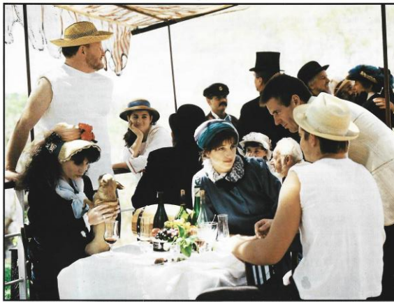
Anticipating a season of successful productions, Garrick members live it up at the traditional opening party in the New Year.

Back in 1992 Garrick celebrated its Diamond Jubilee by compiling and publishing a commemorative calendar.