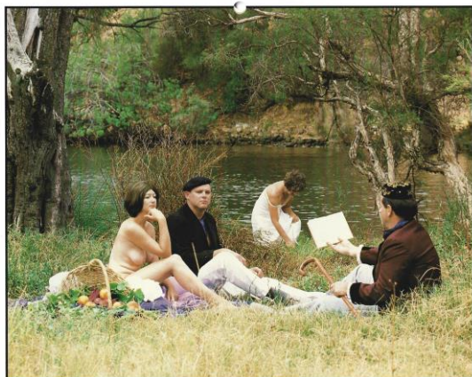
The cast for the next production take advantage of the hot weather to study their lines by the river.